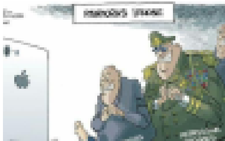
Apple VS. FBI: Bill Gates denies to side ...