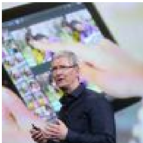
Tim Cook: unlocking the iPhone 5c of the killer of San ...